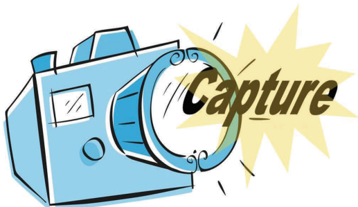
Inner Melbourne Youth Photography Project

Event details are as follows: Wednesday, 14 September 2011, 6.30pm for a 7.00pm start—8.30pm, with supper offered to all guests. Venue: St. Kilda Town Hall, Council Chambers, 99a Carlisle St, St Kilda. RSVPs are essential, please reply by Thursday, 08 September 2011 and extend this invite to your networks and anyone who you know would like to come on the night.