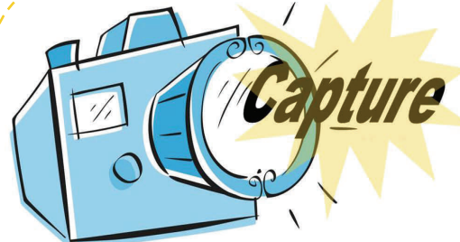
Inner Melbourne Youth Photography Project

Feel free to include at least one live website that you have built as an example of your work.