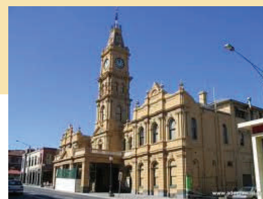
Outside Hawthorn Town Hall.

Supper provided and the opportunity to meet the panel and industry experts at the expo.